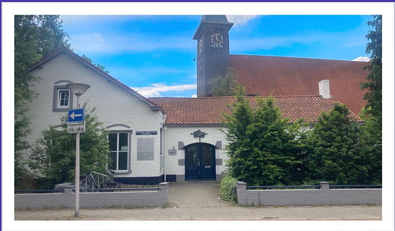
Valeo Primary School School Building

Alard du Hamelstraat 33, 5562 CC Eindhoven